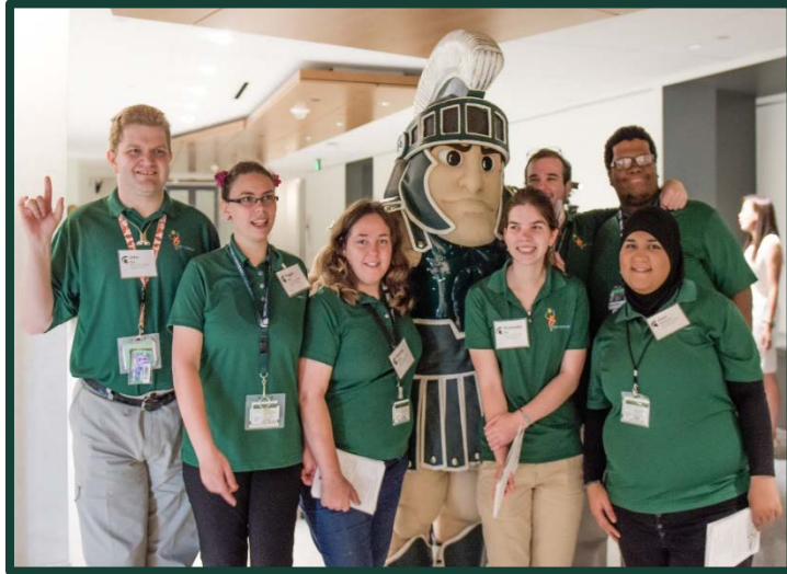
Spartan Project SEARCH Supports Employment of Young Adults with Neuro- developmental Disabilities